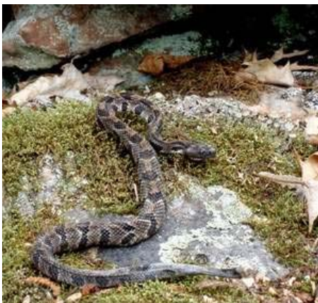
Timber rattlesnakes, although rare, can be found in southern Vermont.

FAIR HAVEN — Scientists appealed for public help Tuesday on behalf of an unlikely species: the venomous timber rattlesnakes of western Rutland County.