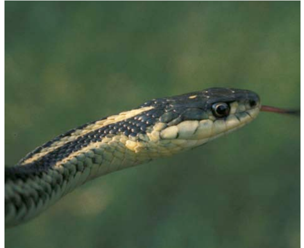
Yellow Upper Lip Olive green head