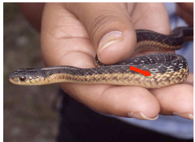
Not as cleanly marked Yellow stripes lower on body (scale rows 2 and 3) May or may not have mahogany stripe

We have been gathering reports of all species of reptiles and amphibians in Vermont since 1994. One of our current target species is the Eastern Ribbonsnake. At first glance, the Eastern Ribbonsnake looks like a very thin Gartersnake with a long and finely-tapered tail. Check for the white lips, reddish head, and mahogany stripe on the lower sides of the Ribbonsnake. Photographs or clear descriptions of these and any other wild reptile or amphibian found would be appreciated. Please include dates, specific locations, and contact information with your reports and send them to: