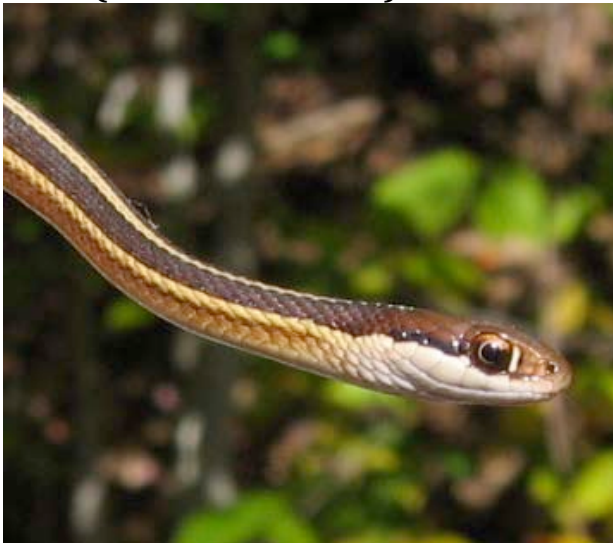
White Upper Lip Mahogany Head