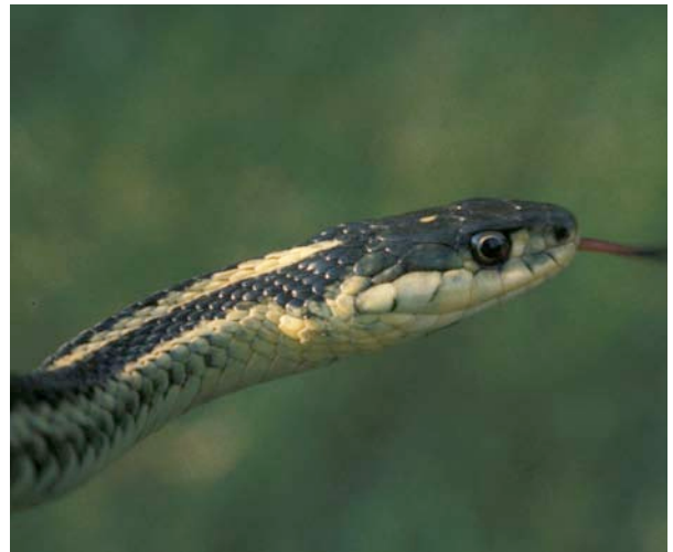
Yellow Upper Lip Olive green head