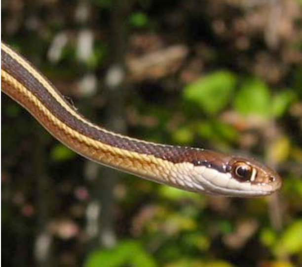
White Upper Lip Mahogany Head